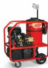
Model 1075BE 4.0 GPM @ 3500 PSI; GX390 Honda gas engine (shown with optional caster kit)