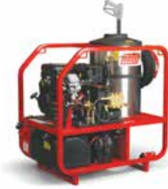
Model 1080BE 4.6 GPM @ 3500 PSI; Briggs Vanguard gas engine (shown with optional stainless steel coil wrap and skid rails)